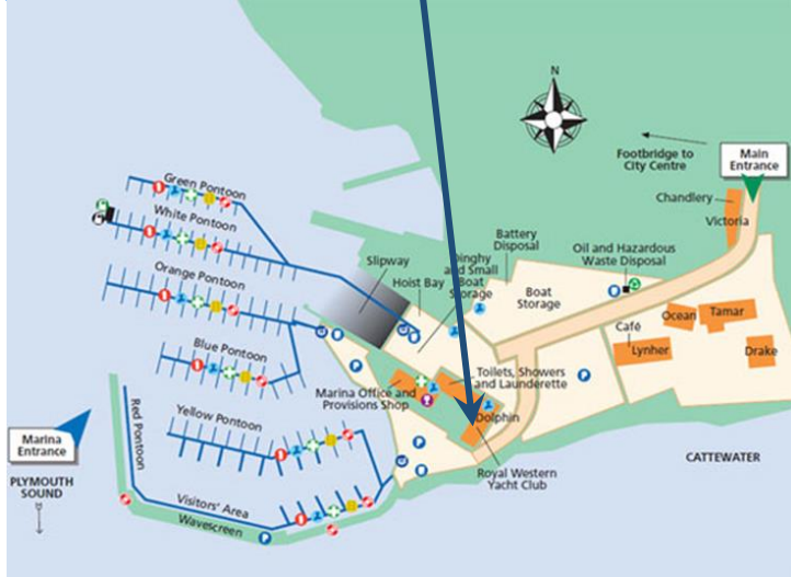
Plym Yacht Club