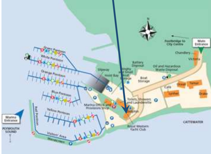
Plym Yacht Club